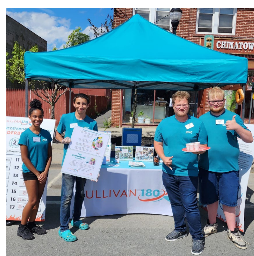
Sullivan 180 Interns supporting outreach efforts at the 2023 Bagel Festival.