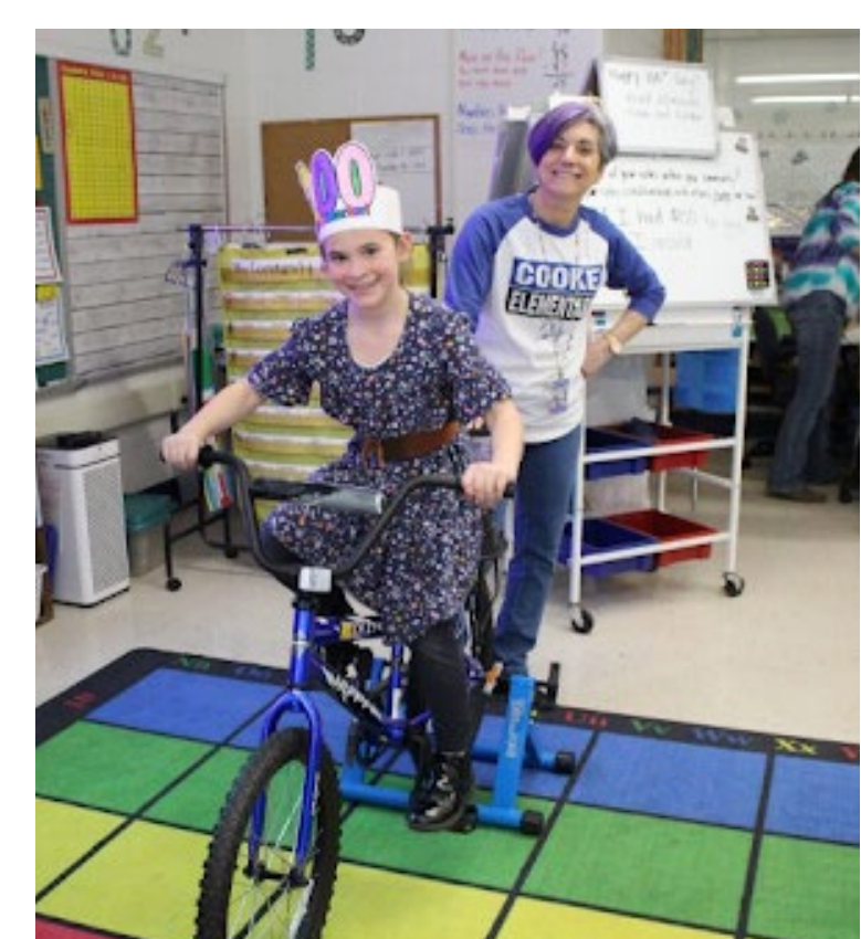
Students at Monticello's George L. Cooke School use the blender bike for healthy celebrations in the classroom.