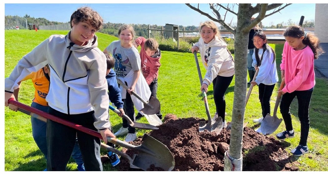
Students from Liberty Middle School assist in planting trees to provide shade at the playground.