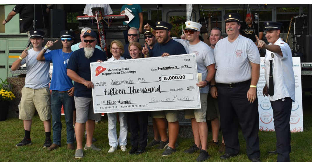
Grahamsville Fire Department celebrates their first place win of the Healthiest Fire Department Challenge.