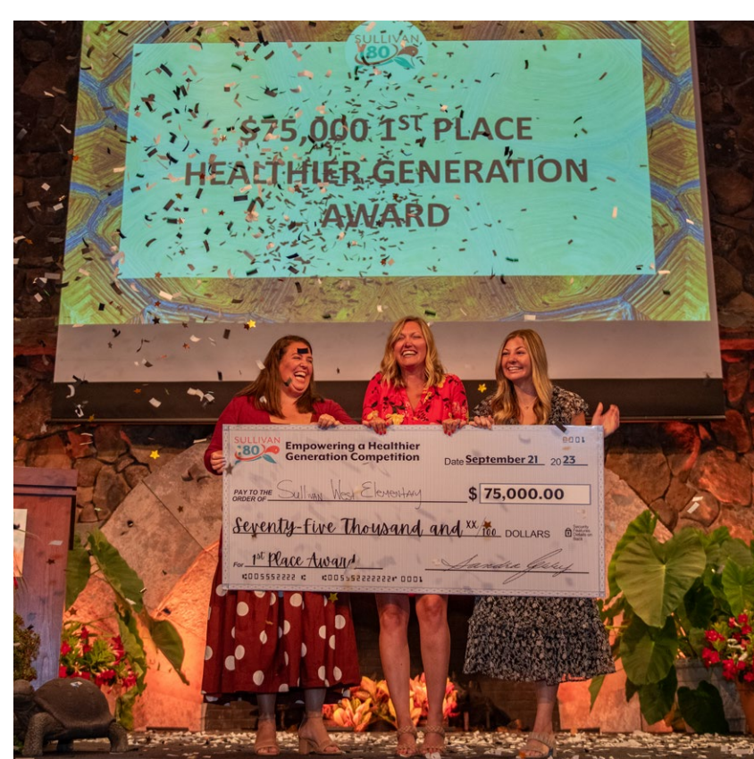
Sullivan West Elementary School, winners of the 1st Place Competition Award in the amount of $75,000, at the Empowering a Healthier Generation Celebration.