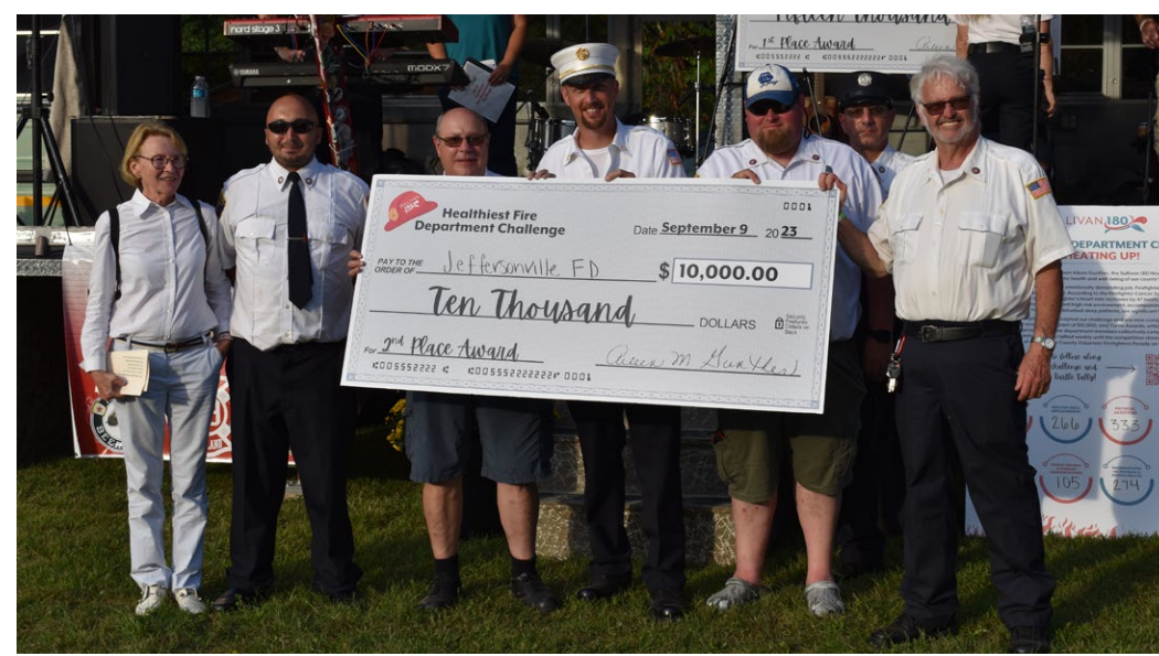
Jeffersonville Fire Department celebrates coming in second place in the Healthiest Fire Department Challenge.