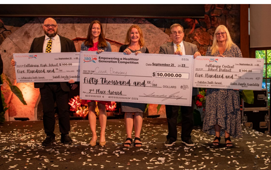
Fallsburg's Benjamin Cosor Elementary School, winners of the 2nd Place Competition award in the amount of $50,000, at the Empowering a Healthier Generation Celebration.