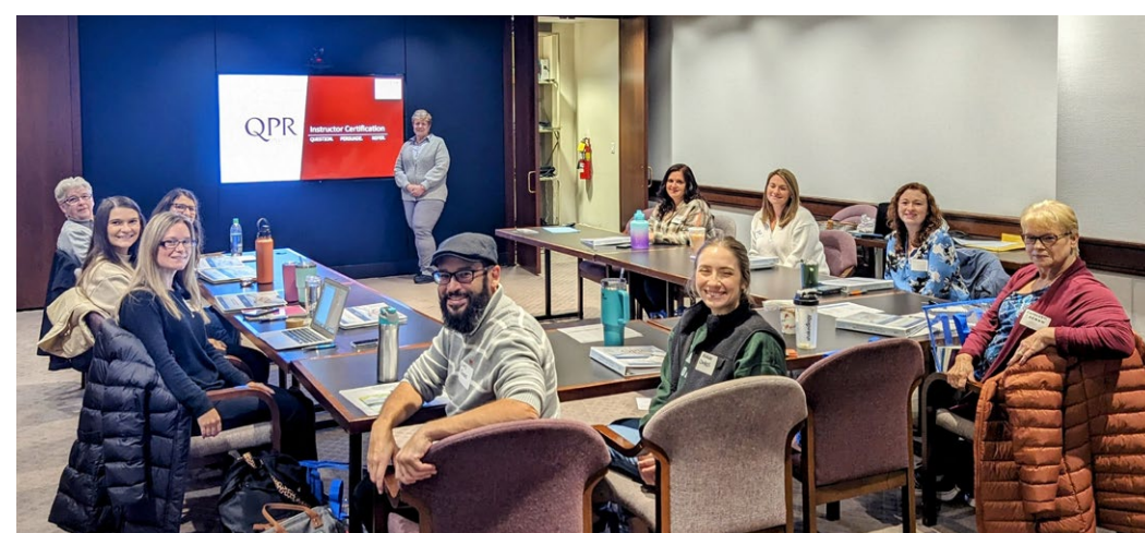
QPR (Question, Persuade, Refer) Suicide Prevention Gatekeepers training of school counselors, school social workers, school nurses, and members from community organizations.