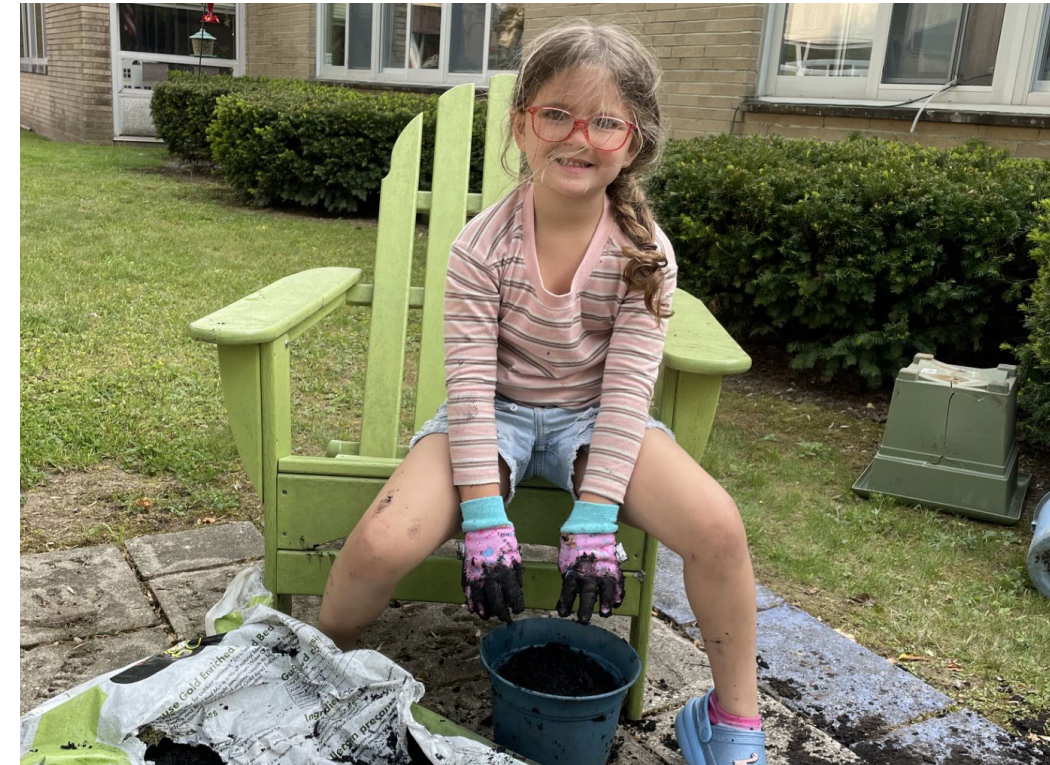
Monticello's Emma Chase School Student gets their hands dirty prepping plants for their Catskill Edible Garden Project.